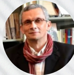
Zine-Eddine Seffadj (UFC)